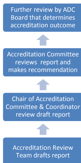
Diagram 2: Accreditation decision making hierarchy

Several steps progressively involving different bodies contribute to a decision by the ADC on accreditation of an education provider and program of study. An Accreditation Review Team undertakes a site visit and prepares a draft report with their findings. An initial review of the report is carried out by the Chair of the Accreditation Committee and the Committee's relevant discipline Coordinator (neither of whom is involved with the team) to ensure the conclusions and recommendations are sound and based on the findings and are consistent over time. The Accreditation Committee then reviews the report to confirm (or otherwise) and formulate the overall recommendation to be made to the ADC Governing Board for accreditation of the program. The ADC Board considers the Committee's report and recommendation and determines the final accreditation outcome. The decision and report are then forwarded to the Dental Board to consider for approval of the program.